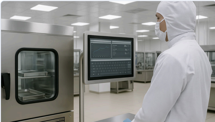
Industrial Equipment Control