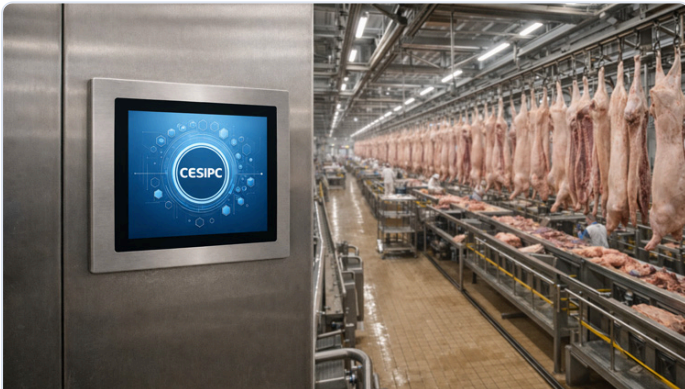
Industrial Equipment Control